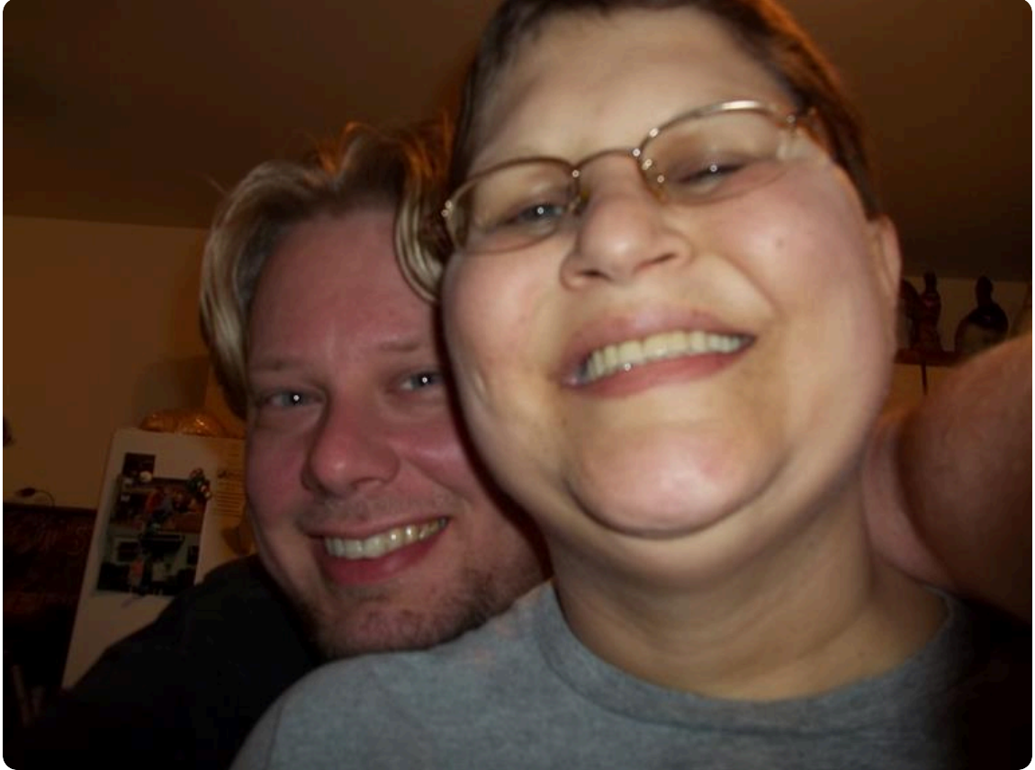
our last happy new year